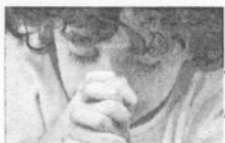
WORLD DAY for Consecrated Life

WEEK OF 1-29-12— $7,611.65 Budgeted Collection Amount $8,100.00