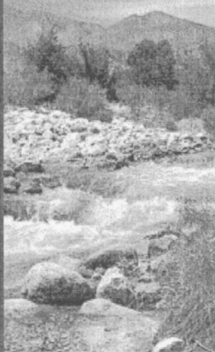
Example Photo for Liturgy for Mass 01051, 1998, 1910 CCB Cover design © Liturgical Publications Inc.

One of the more successful processes of reconciliation was the Truth and Reconciliation Commission established in 1995 in South Africa after the abolition of apartheid. Its mandate was to bear witness to, record, and in some cases grant amnesty to the perpetrators of crimes relating to human rights violations, as well as reparation and rehabilitation. The commission looked at violations committed by all sides during the apartheid years, a balance that helped establish its reputation for fairness and equality. Still, there were many who criticized the effort and some who found it ludicrous. What is clear from reports about the commission's activities is that its greatest impact was in small rural towns in which a large amount of the population was involved in the process. In the larger cities, where the commission's work touched only a few people, its success was far more muted.